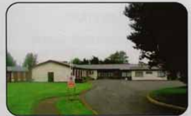
Society of St. Vincent De Paul St Josephs Conference

Ozanam Holiday Centre Mornington, Co. Meath