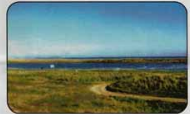
Welcome to Mornington